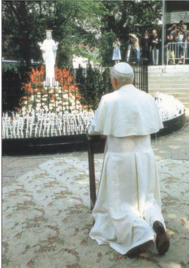
Pope John-Paul II by the statue of the Virgin Mary

"These apparitions in Beauraing are fully approved by the Holy See: July 2, 1949"